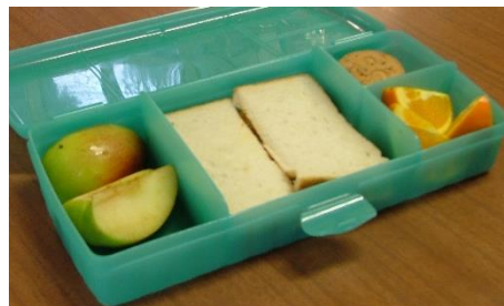
Here is an example of a rubbish free lunch box

Thank you for your ongoing support and efforts. Remember, to be sustainable means “there is enough, for everyone, forever.”